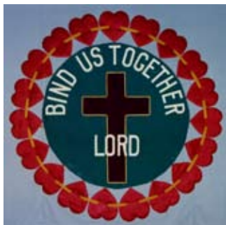
LWML MN North District 1990 Convention Logo