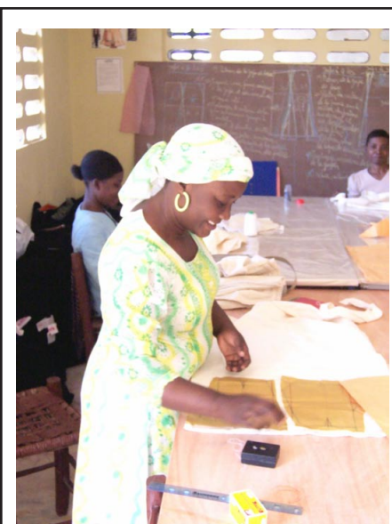
Haiti Sewing Center

Stamps in albums, older postcards and envelopes (from 1930 or earlier) and first day covers should be sent as they are.