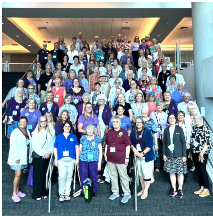
Members from Minnesota North District who attended the LWML Convention

God's blessings this summer and see you at Lutheran Island Camp August 8-10.