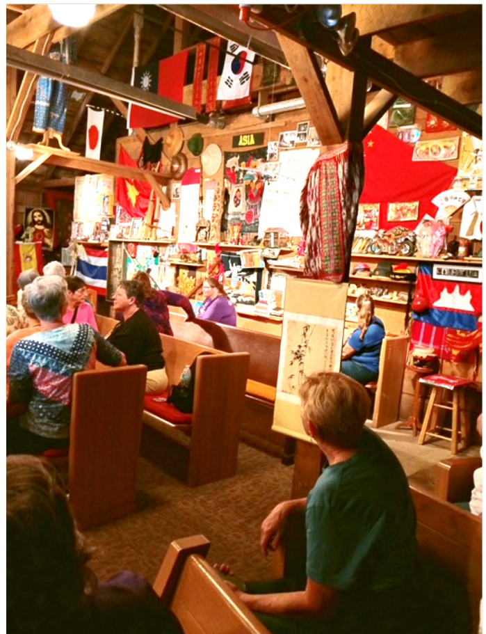
Inside Mission Central

Enjoy adding to your standing rules and modifying them as your organization evolves, takes on new traditions, and serves with gladness!