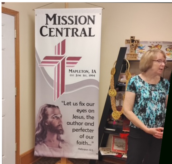
Inside Mission Central

Begin the process of planting the seed of service within the LCMS early with students. One never knows how an encouraging word at a young age may affect someone's future!