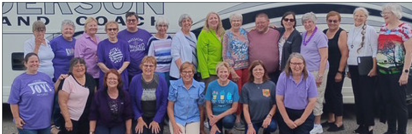
Catching the bus for the LWML Convention at Beautiful Savior in Fargo