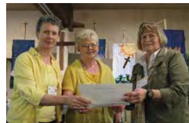
Welcome new society, Beautiful Savior, Callaway