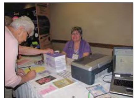
Christian Life exhibit at the convention.