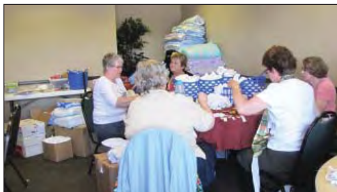
Servant Event: Rolling bandages

Thank you for the "Gifts from the Heart" donations. You again stepped up for our seminary students with phone, gift and gas cards. We logged in stamps and Campbells soup labels. The Servant Events on Monday were a success. Sixty women participated, rolling bandages, tying baby quilts and lap robes, and making eyeglass cases. The delight of giving was evident with the joyful buzz in the room.