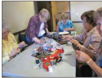
Servant Event: Eyeglass cases from ties

Samaritan Home was amazed at the gifts they received and Lutheran Island Camp labored with joy as they handled the many pounds of shoes that were donated.