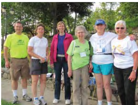
SON Rise Mite Walk