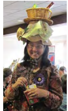
Fun with Hats!