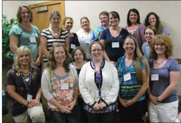
14 YWRs were at convention