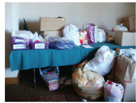
Ingathering items at 2012 District Convention