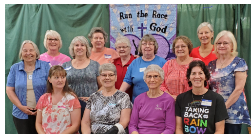
LWML Retreat First Timers

Despite not having a campfire due to the drought, there was time to enjoy evening snacks in the Fireside Room while visiting with friends. Other weekend activities included relaxing, participating in numerous crafts, touring Christ Serve Ranch, and exploring the beauty of the Island. Mark your calendar – next year's retreat is scheduled for August 12-14, 2022.