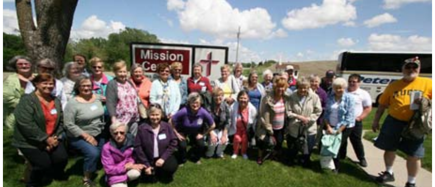
Entire group that attended the tour in front of Mission Central Sign