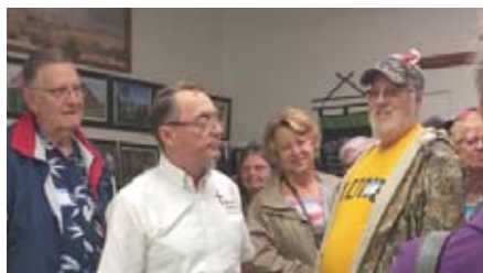
Tour of the office