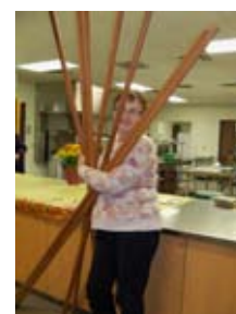
Finding a new home for the banner poles!