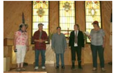
Talent Show: District Board, "Aren't you glad I am a board member?"