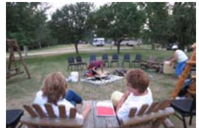
Gathering around the campfire