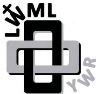
New YWR logo!

"There is one body and one Spirit—just as you were called to the one hope ..." (Ephesians 4:4).