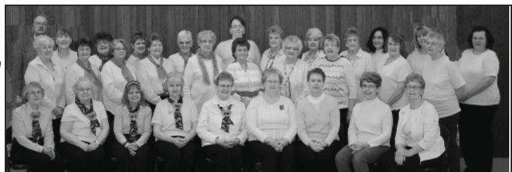
The 2012 Convention Nuclei Committee