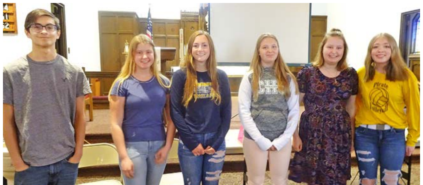
Youth of Our Savior's, Crookston, made lunch for the May 11 event.

We look forward to seeing you at one of these events. Come and be empowered, enlightened and entertained with fellowship and fun!