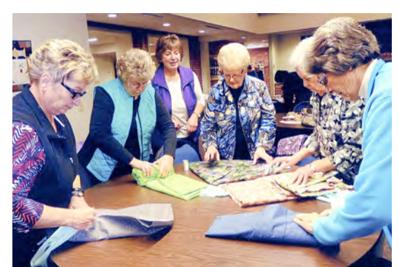
The ladies of Zion Evening Guild, Alexandria, put together sewing kits to be sent to Lutheran World Relief.