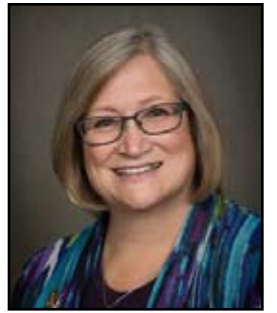
BREAKOUT SESSION - A Status Quo or Change for Growth

Be sure to indicate your Breakout Session choices on the Convention Registration Form.